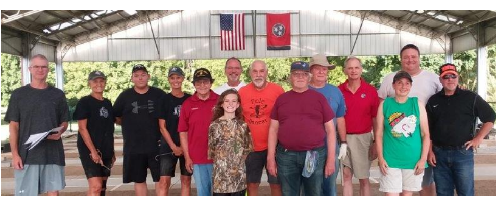
8/20/21 Group Pic. Clarksville