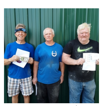
8-18-21 CRS CL D 1st M. South 2<sup>nd</sup> H.Nease 3<sup>rd</sup>